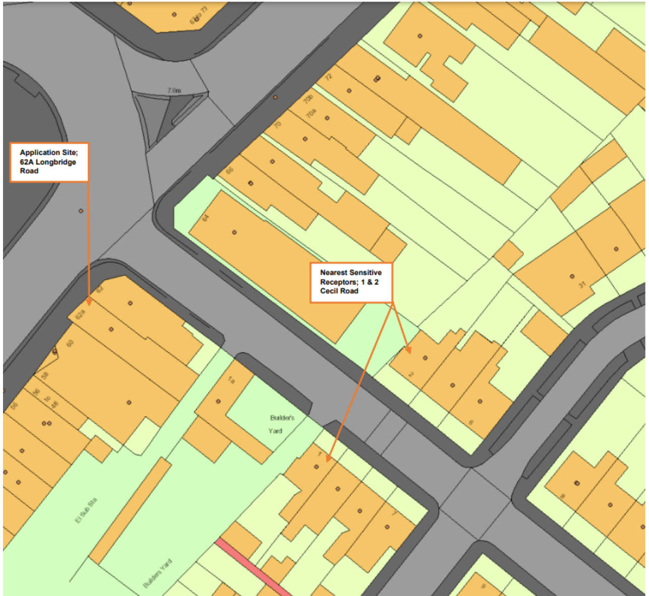
Figure 1: Map depicting Application Site & Nearest Sensitive Receptors