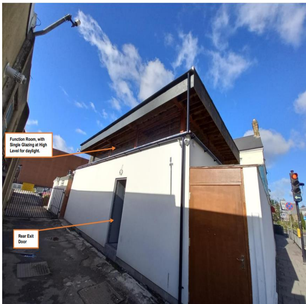
Figure 4: Photographic View (Rear Elevation) of Application Site depicting Function Room with Glazing at High Level