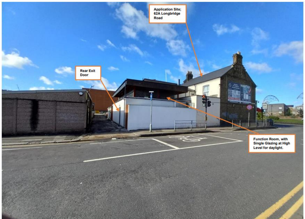
Figure 3: Photographic View (Side Elevation) of Application Site depicting Function Room with Glazing at High Level